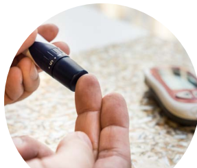
Frequent monitoring of blood glucose level