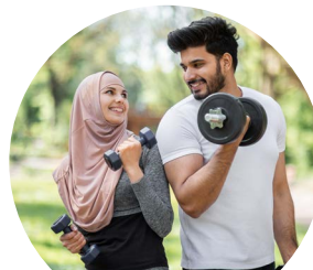
Exercising whilst fasting