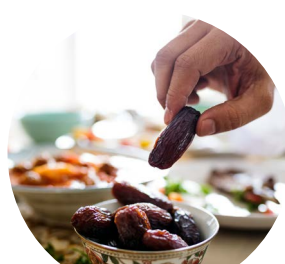
When to break the fast