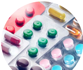
Changes in medication